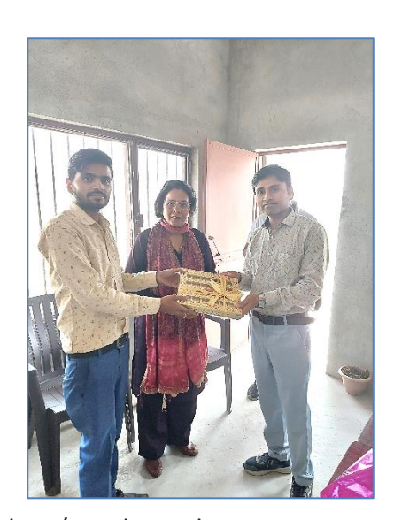
student of the class... Fantastic that what they / we do works.

Anther lovely experience was that we were visited by people from the area, partly by teachers from other schools, schools where our students continue after 5th grade. They wanted to see which school this was, because they experienced again and again that students from TellusArt Academy, at the end of the school year, were the best